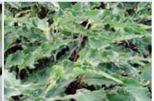
Florida Irish Lace