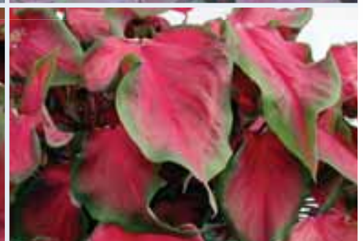
Florida Red Ruffles