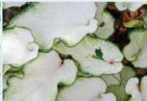
Florida White Ruffles